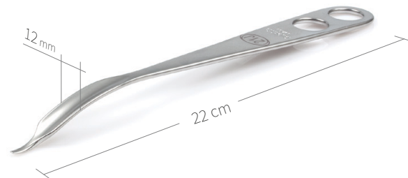
24.51.137 Subtilis Juvenile Bonelever Hohmann styled beak 12 mm / 22 cm