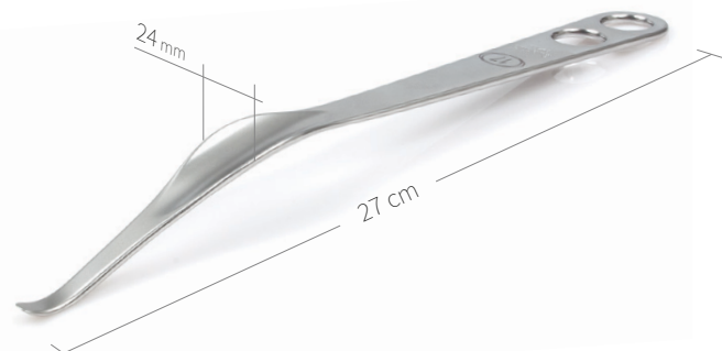
24.51.140 Subtilis Juvenile Hip Lever Eva 24 x 45 mm / 27 cm