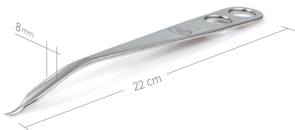
24.51.136 Subtilis Juvenile Bonelever Hohmann styled beak 8 mm / 22 cm