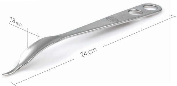
24.51.138 Subtilis Juvenile Bonelever Hohmann styled 18 x 37 mm / 24 cm